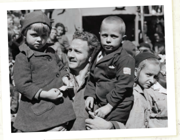
Polish refugee children arriving in Wellington