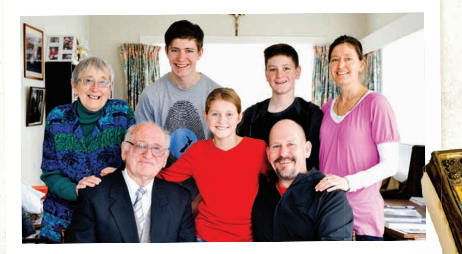
My family visiting Babcia and Dziadzia